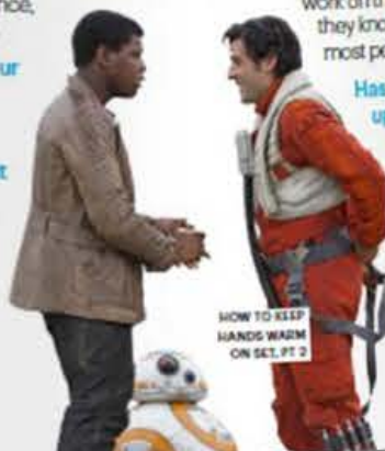
HOW TO KEEP HANDS WARM ON SET, PT 2

Has anyone come up to you yet and said, "Actually, I thought The Force Awakens was a bit rubbish"? [Laughs] I've heard